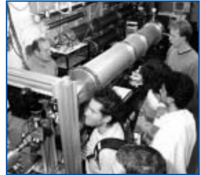
Seeing real-life SR work on one of the experimental stations at Daresbury Laboratory.

enthusiasm for the whole school programme right from the beginning, with virtually full attendance at every session (scientific and social). In fact, many of the most interesting questions came from those in disciplines lying outside the particular session topic; it was very encouraging to hear students of biological science, for example, say how interesting they had found the explanation of engineering strain measurements, and to have favourable comments on medical imaging and biological spectroscopy presentations from physicists.