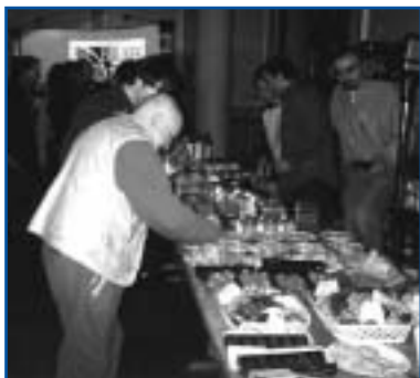
A few adjustments had to be made...

University of Oxford on "Weak Data can still be Good Data". David started by noting that CCD detectors have revolutionised small molecule crystallography. Crystal size is no longer such an issue and absorption/scaling programs such as SADABS can cope well with large crystals. He described a series of data sets from a tetraphenylene crystal that were collected at the recommended exposure time, a slow exposure time, a fast and a very fast exposure time. It was found that there was very little difference between the structures obtained for the slow, recommended and fast exposure times. For the very fast data collection, where observed data was only marginally stronger than absent data, the structure was solved by cutting off the weakest data. There was very little difference of chemical relevance between the structures derived from the very fast data set and the stronger data sets; however, as the speed of the data collection increases U_{eq} increases. David suggested that we could be doing 10-12 data sets a day, but people aren't doing this as they don't have the capacity to process the data. He