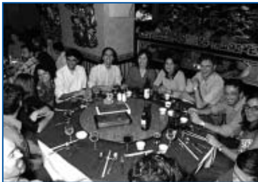
The hard work is done! Relaxing at the closing dinner.

27 participants gathered in Chester at the end of August for a 10-day course covering both theoretical and practical aspects of SR and its applications. 'Students' (actually ranging from new postgraduates to academic and central facilities staff) were drawn from many different countries, mainly in Europe, but also including Canada. The course was sponsored by some of the UK research councils (particularly by