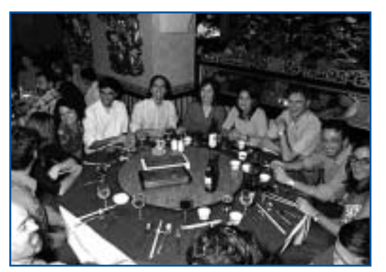
The hard work is done! Relaxing at the closing dinner.

Discussions continued well beyond the timetabled sessions, through meal-times and other