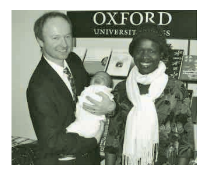
Definitely the youngest crystallographer at the meeting!