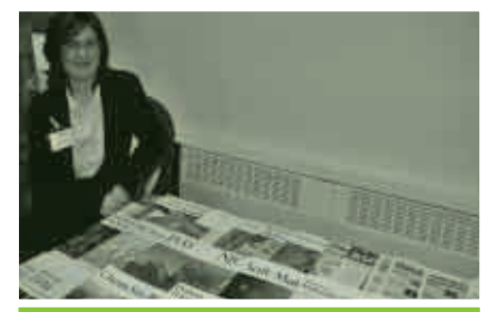
Crystal Engineering Communications