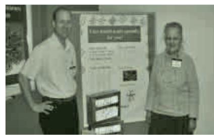
Beevers Miniature Models